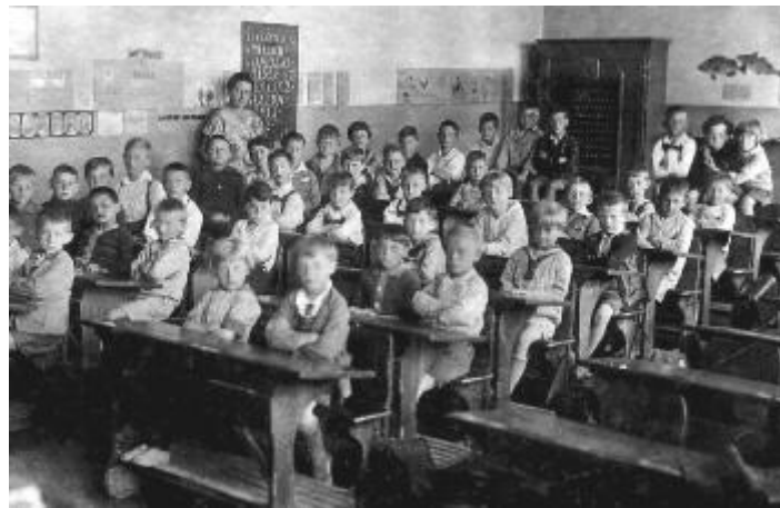
The serious side of life begins: year 1 in the Gebeleschule 1927