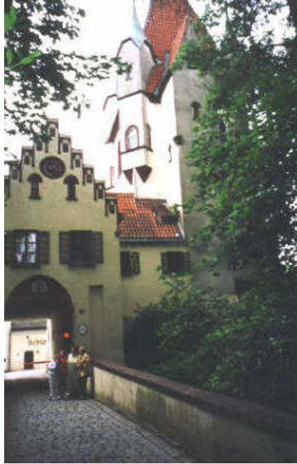
Visit to Kaltenberg in 2000