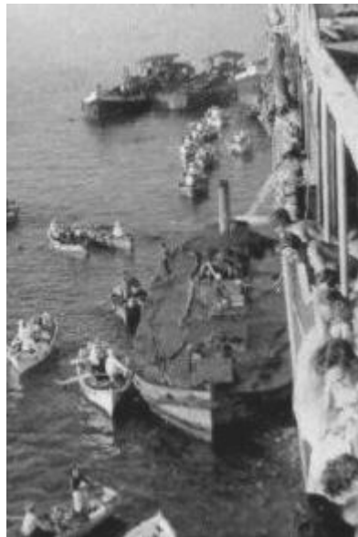
In the port of Aden 1944