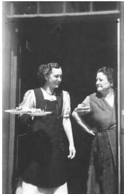
Two of my fellow workers in front of the Bräustüberl in Kaltenberg - 1938

Work started at 6 am, with a break for breakfast at 8 o'clock and the midday meal at 12 noon. The working day finished at 4 pm. My first job was to operate the bottle labelling machine. The bottles, having been thoroughly machine washed and hand inspected by two ladies, were then placed into the rotating beer filling machine, operated by a male colleague, who also had to snap close each bottle by hand. He then placed the bottle on a table between the filling machine and the labelling machine. The next employee, in this case myself, had to pick up each bottle from this adjoining table and place it in the appropriate position on the rotating labelling machine. The containers for glue and labels had to be monitored and refilled from time to time. The labelled bottles then had to be taken off the machine and placed into a large wooden crate - I think 2 dozen x ½ litre bottles per crate. The heavy full crate had to be pushed through an opening in the wall into the cold bottle storage section.