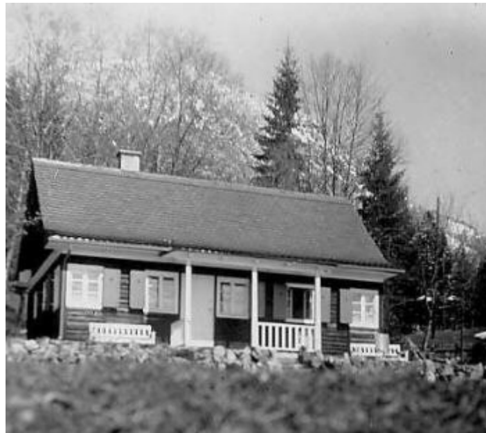
The Häusl in Walchensee

Both my parents loved walking, hiking, cycling and life in the country. In 1926 they decided to build a small family size log cabin which we called our Häusl , in the village of Dorf Walchensee in Upper Bavaria. My father became a popular figure there, where life revolved around a couple of farms, a hotel and the usual ancillary local trades and facilities. He was happy to give free legal advice to anyone in need. In the early years I used to attend the local village school for a month or so in the summer, because my mother, sister and the maid arrived in Walchensee in early June, prior to the official Munich school holidays, to enable us to spend as much time as possible in the country. My father joined us for 2 weeks in August and sometimes also managed to squeeze in a long weekend.