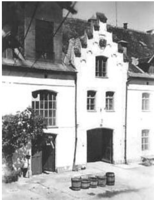
The brew house in the Schlossbrauerei Kaltenberg in 1938

Some weeks later I was moved to the barrel washing and inspection section. Each wooden barrel had to be individually placed onto the belt driven machine where it was cleaned internally with high pressure water jets and externally scrubbed with heavy duty brushes. The barrel was then carefully inspected by hand with a waterproof electric light tube inserted through the tap hole to check the soundness and cleanliness of the inside pitch coating. This process was followed by taking a wooden bung, which had to be placed into the tap hole. The bung was then given a hard blow with a very heavy iron mallet. This mallet appeared to be really weighty in the first week, but by the end of my year's apprenticeship, I considered a day in the barrel washing section as one of the less strenuous jobs in the brewery!