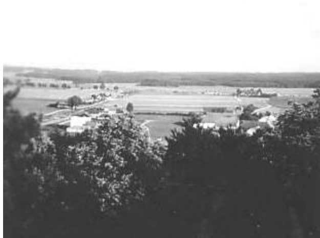
Kaltenberg 1938: View of the countryside from my room in the castle's tower

Schülein. I had my own completely separate room, high up in the castle's tower, with a superb view of the surrounding countryside.