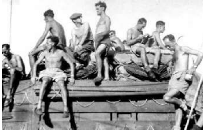
On board my troopship to India 1943/44

through the Suez Canal, the Red Sea and then across the Indian Ocean before docking in Bombay, India. It was January 1944 and it was very hot. It felt good to have solid ground under our feet again!