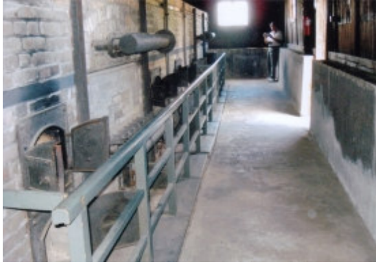
Rear of the ovens where ashes were removed