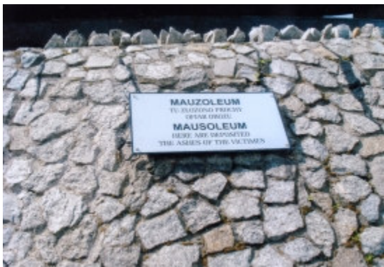
Plaque at the mausoleum in Majdanek