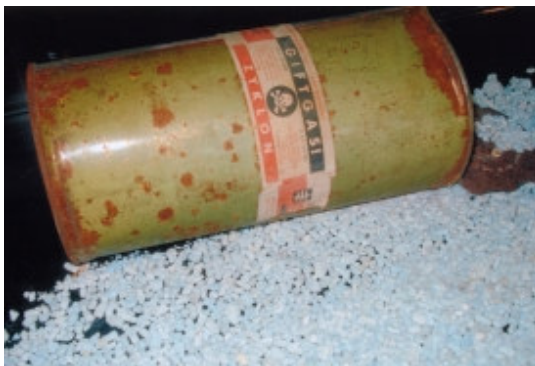
Zyklon B poison gas canister