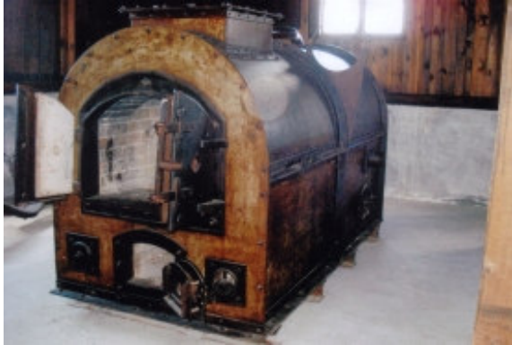
Single oven; when Majdanek started operating this oven was used