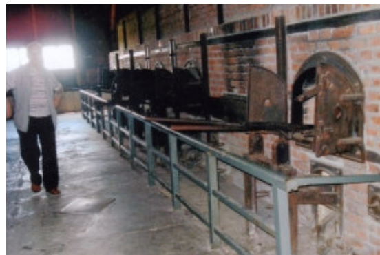
Front of the ovens