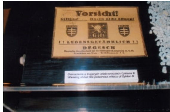
Warning about the poisonous effects of Zyklon B