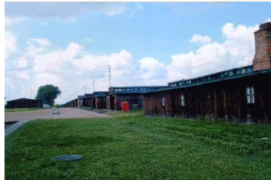
Barracks; the big red box is recent fire fighting equipment