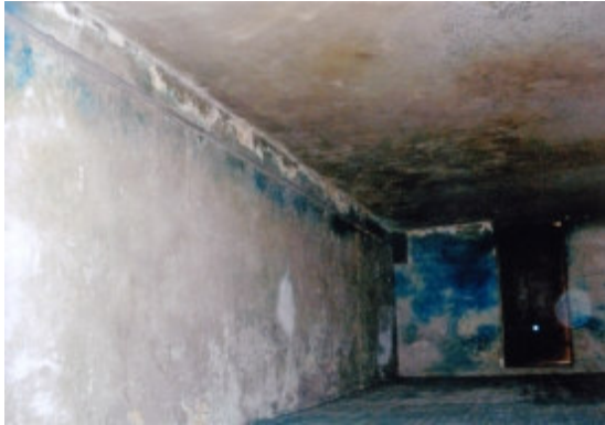
Gas chamber; blue color is residue of Zyklon B poison gas