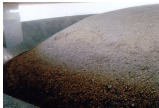
Mausoleum with ashes and small bones