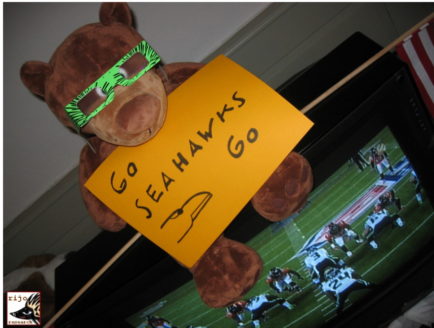
A Nuremberg Seahawks fan (with fancy glasses) ...