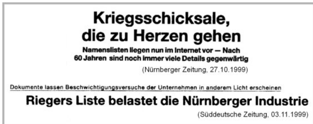
Newspaper headlines about our featured list of former forced laborers in Nuremberg

Consequently the dynamics of the project caused a widening of its scope regarding the times, spaces and subjects which are covered. With this approach we succeeded in initiating public discussions, e.g. about forced labor during WW2 in the Nuremberg region and its compensation, supplying facts which eventually led to political action, lately the creation of the memorial on Plärrer square in October 2007. By such activities we did not only make friends but our coat of arms displays a (when it has to be) pugnacious porcupine and in moments of doubt the truth is a guideline which always can be trusted. Thus a lot is left to be done, particularly research on the perpetrators of Nazi injustice before and after 1945 or the volatile fashions of Erinnerungskultur .