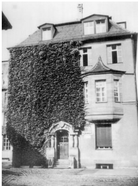
Building of G. Jondorf factory, erected in 1913 (picture approx. 1937)

Although the nature of the market needs changed during World War I, the need for burners continued. The firm also branched out into manufacturing electric plugs and sockets from the same ceramic material used in making the burners. To distribute these new items, a sister-firm, Elektronoris , was founded.