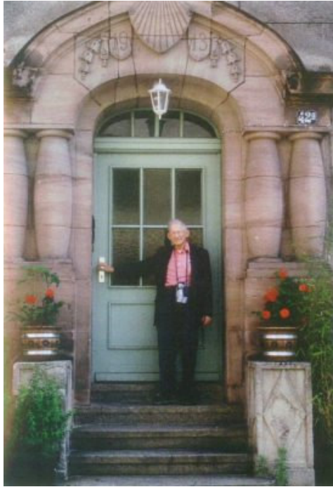
The author in front of former G. Jondorf factory, 2003