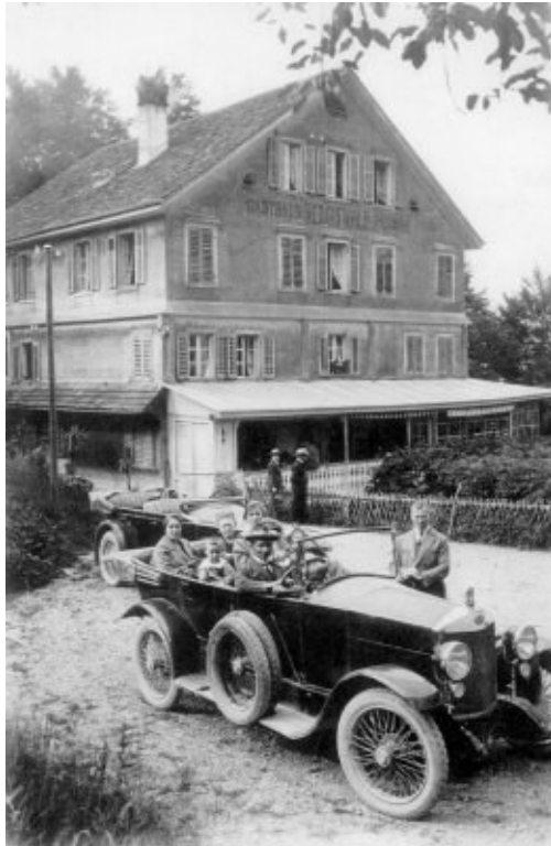
On vacation in Switzerland, 1925

collars and such. These were kept in a bedroom drawer ready to be packed on short notice. Emil's packed suitcase looked like a neat traveling salesman's sample case.