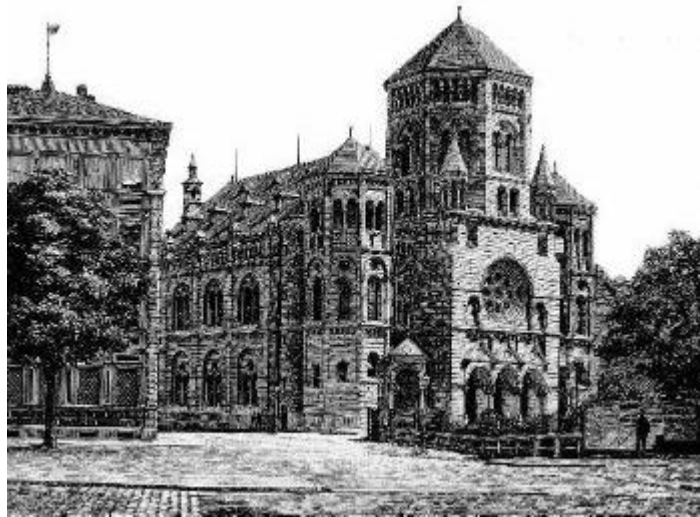
The synagogue in Herzog-Max-Strasse, erected 1884 - 1887