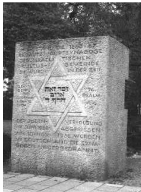
Two different views of the memorial at the site of the leveled synagogue in Herzog-Max-Strasse, solemnly revealed in 1969. See also: Project Jakobsplatz: A new synagogue for Munich

1939 Decrease of the number of Jewish businesses until March to 162, until the year's end to 27.