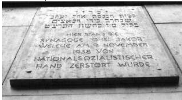
Today only a memorial plaque reminds the visitor of the Ohel Jakob synagogue.