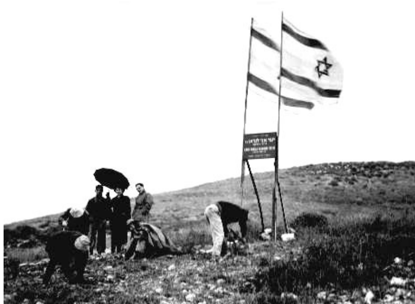
Tree planting in 1952 (today there is a forest)

Almost sixty years old! That's quite an age to look back upon. Even if it is sixty years in the life of a country, and a new country at that. What was it like, starting out as a newly declared state, and already at war in a bitter fight for its existence, surrounded on three sides by an implacable enemy, and the fourth side a beautiful, blue sea?