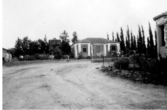
Pardess Channah

Beside PICA, other corporations were offering similar plans, for instance Yachin, which was involved in a project further south in an area called Vaadi Chavarith. The German Government, in order to speed up emigration of Jews, had entered into an agreement with the British Mandate powers with the establishment of a special trade account, through which German marks could be exchanged in payment for Palestinian imports to Germany. This measure enabled German Jewish “capitalists” to transfer their funds to Palestine without losing the biggest part of their fortune in the exchange of currencies: The German mark was selling on the free market at a tremendous discount. Although Germany leveled a 25 % tax against these transfers, an increasing number of would-be-emigrants applied for this opportunity, and the pipeline was filling up at a very rapid rate, requiring already many months before the actual transfer could take place. To receive an immigration visa from the Mandate Power, Jews either had to be “capitalists” or provide proof that they had attended courses which provided them with special skills in agriculture or the crafts; university trained professionals were admitted freely also and the number of physicians per capita of the population was setting a record. As a consequence of these restrictions, the number of illegals was growing, and the Jewish community did everything to protect them against deportation.