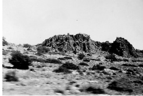
On the way to Pardess Channah by minibus