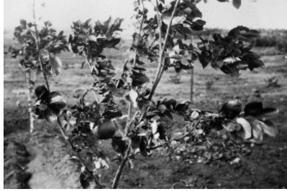
Young grapefruit tree