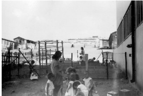
Snapshots from Daganía

After our return to Tiberias, our travel companions, whose further itinerary differed from ours, left us to return by bus to Haifa, while we got ready to call on a friend of ours from Fürth, who lived with her husband, a physician, in a new tract of homes, some distance from our hotel. The solitary walk along the highway, climbing steadily in an easterly direction, proved a bit nerve-tingling, as darkness quickly enveloped us; to find the right house proved not too easy. We were astonished by the large number of trucks passing us, heading for Haifa and the coast. They were mostly antiquated monsters, their engines straining and backfiring frequently; the explosions sounded like gunfire in the still of the moonless night. We had a nice visit with the conversation, as it would on many such later occasions, dealing with two topics: news from home and possibilities in Eretz Israel.