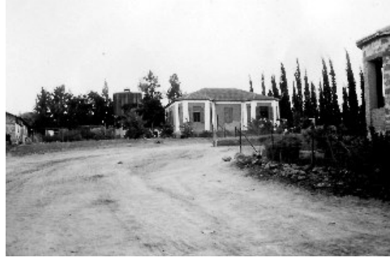
Pardess Channah

Beside PICA, other corporations were offering similar plans, for instance Yachin, which was involved in a project further south in an area called Vaadi Chavarith. The German Government, in order to speed up emigration of Jews, had entered into an agreement with the British Mandate powers with the establishment of a special trade account, through which German marks could be exchanged in payment for Palestinian imports to Germany. This measure enabled German Jewish “capitalists” to transfer their funds to Palestine without losing the biggest part of their fortune in the exchange of currencies: The German mark was selling on the free market at a tremendous discount. Although Germany leveled a 25 % tax against these transfers, an increasing number of would-be-emigrants applied for this opportunity, and the pipeline was filling up at a very rapid rate, requiring already many months before the actual transfer could take place. To receive an immigration visa from the Mandate Power, Jews either had to be “capitalists” or provide proof that they had attended courses which provided them with special skills in agriculture or the crafts; university trained professionals were admitted freely also and the number of physicians per capita of the population was setting a record. As a consequence of these restrictions, the number of illegals was growing, and the Jewish community did everything to protect them against deportation.