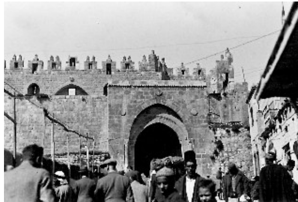
Jerusalem, Lions' Gate

Situated opposite the library were the buildings of the University, hardly the equivalent of its European counterparts in size and architecture. We visited a modest physics lab and viewed a fauna- and flora exhibit in another hall. Additional buildings were under construction, meant to alleviate the present lack of space. After walking through a tiny stand of aromatic pines we reached a broad terrace which offered an overwhelming panorama of the Judean desert, the Dead Sea and the heights of Transjordan at the horizon. At the noon hour, the air was incredible clear, making distances hard to estimate. Like the settings of a giant stage repeating themselves over and over, yellowish-brown sand dunes stretched down to the Dead Sea. The shimmering blue of the water, the bright azure sky above contrasting with the brown of the desert combined into a picture of indescribable beauty and frightening desolation at the same time.