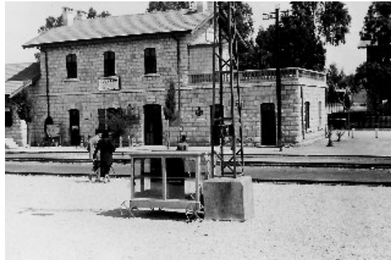
Chedera train station