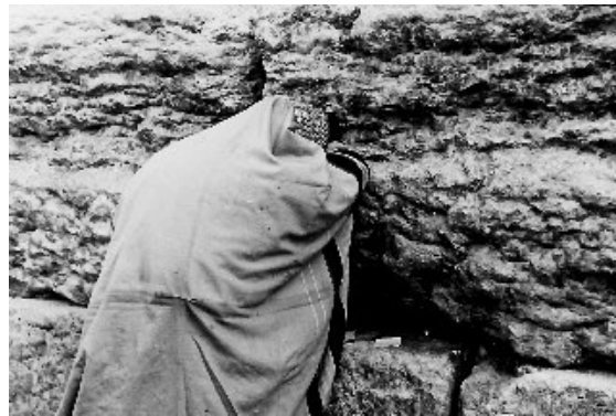
At the Wailing Wall