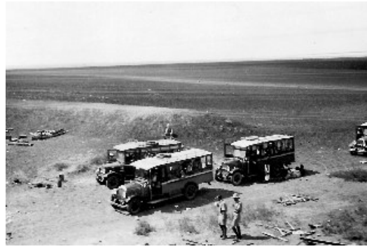
“Tents and vehicles of the British occupation force” en route to Pardess Channah