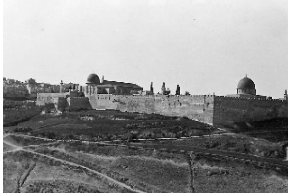
View from Mt. Scopus to the Temple Square with El Aqsa Mosque (left) and the Mosque of Omar