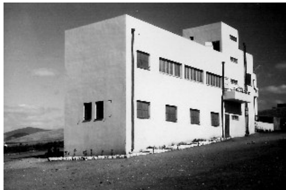
Kvutzah Dagania