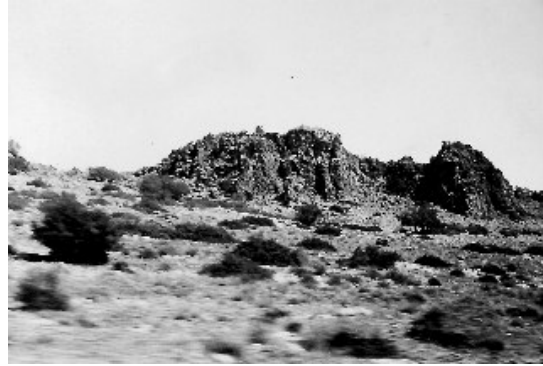
On the way to Pardess Channah by minibus