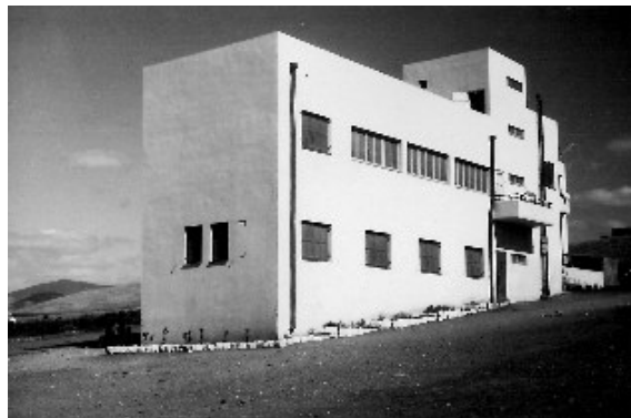
Kvutzah Daganah