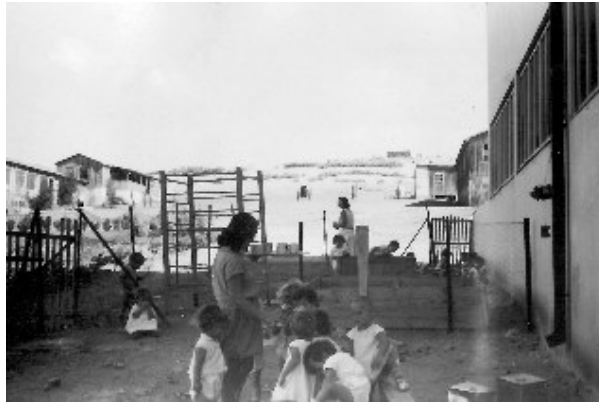
Snapshots from Daganía

After our return to Tiberias, our travel companions, whose further itinerary differed from ours, left us to return by bus to Haifa, while we got ready to call on a friend of ours from Fürth, who lived with her husband, a physician, in a new tract of homes, some distance from our hotel. The solitary walk along the highway, climbing steadily in an easterly direction, proved a bit nerve-tingling, as darkness quickly enveloped us; to find the right house proved not too easy. We were astonished by the large number of trucks passing us, heading for Haifa and the coast. They were mostly antiquated monsters, their engines straining and backfiring frequently; the explosions sounded like gunfire in the still of the moonless night. We had a nice visit with the conversation, as it would on many such later occasions, dealing with two topics: news from home and possibilities in Eretz Israel.