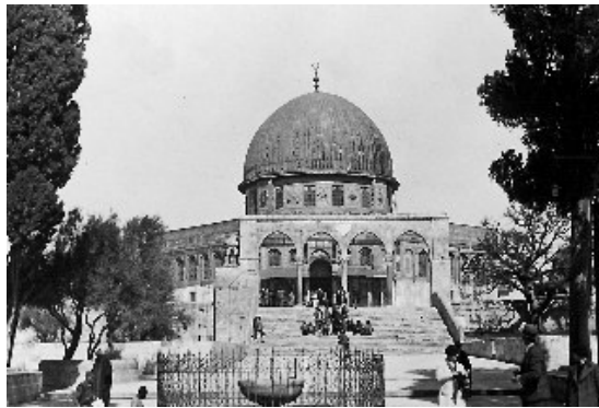
The Mosque of Omar

On the following day, we visited both mosques on the Temple Square. A huge boulder inside the Grand Mosque was, according to the guide, the rock Moriah, on which Abraham was to sacrifice his son Isaac; even the place, from which the goat came, which finally took Isaac's place on the altar, was pointed out to the assembled tourists. Pious Jews do not enter the mosque, which is a most holy shrine for Moslems. The floors of both mosques were covered with magnificent carpets, and visitors were asked to wear soft slippers over their shoes upon entering. The price of admittance was exorbitant, and baksheesh was due here and there on top of it. But the splendor of mosaics, wood carvings, antique and contemporary stained glass windows more than compensated for the expense. Pious Moslems, lying prostrate on the floor, paid no attention to the curious tourists. No Moslem women were to be seen; they, like orthodox Jewish women, are restricted to a separate, out of sight section.