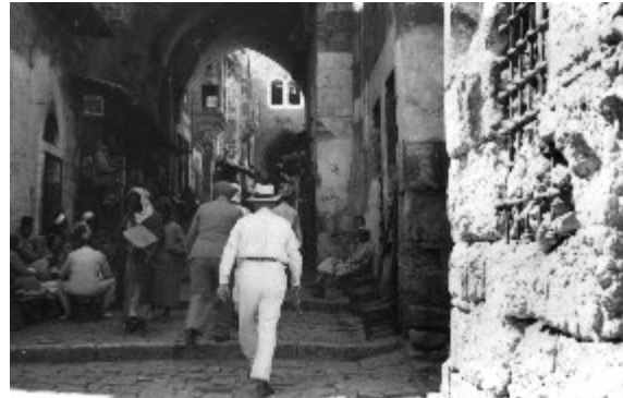
Jerusalem, Old City

Finally the lane turned. Here we changed a bill into copper coins: beggar was standing next to beggar, lame, blind, crippled; Jewish women with the marks of leprosy or some other horrible skin disease were stretching their hands out to the cry of “Rachmanuth! Rachmanuth!” - have pity -. They seemed to come from holes and caves - we shuddered, as we passed.