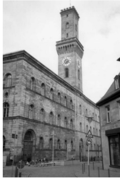
Fuerth's city hall with its picturesque tower

The street we lived on was a long thoroughfare leading to the village of Schwabach. A tram passed by, and electric trolley cars with overhead lines and long poles leading up to cables above clanked past our house every ten minutes. We were used to the trolley and traffic noise going day and night. Our street sloped gently down to an "Unterfuehrung", an underpass beneath a railroad bridge, where trains chugged across overhead. Important routes crossed in our town going from north to south and from east to west.