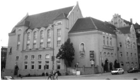
The building of the adult education center in Schwabacherstrasse, named after its Jewish founder and benefactor "Berolzheimianum"

We were one of the first families who bought a gas appliance to heat the water in the bathroom. While already a modern convenience, gas was not yet commonly used. No one in our house knew of the dangerous fumes gas stoves give off if not properly lit, or the possibility of combustion. Once, when I was quite young, I was waiting for Alice to give me a bath. To heat the room, the tub had to be filled with hot water. Mother must have opened the gas valve too early; when she struck the match, there was an explosion. She fell down. I screamed in terror for help. I had seen the flames shoot out. Thank goodness, it turned out to be more of a scare than anything else. The maids came running, and Mother opened her eyes soon after and came back to life. She had only bruised herself, not broken any bones. All was well again. Later I noticed that her eyebrows and hairline were singed off, and there was a burned smell too. After a few months hair and eyebrows grew back. From then on Mother was more careful.