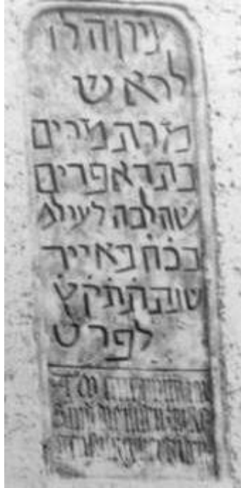
Gravestone from the medieval Jewish cemetery of Regensburg at the front of the Cham town hall

1519 At the western front of the town hall one can find the gravestone of Mirjam, the daughter of Ephraim. She died on May 28, 1230. An inscription beneath the Hebrew letters states that in the year 1519 all Jews were evicted from Regensburg. The stone was originally on the Jewish cemetery in Regensburg. When the Jews were driven out, the cemetery was destroyed and many gravestones were used as construction material. Others were brought to villages and towns in the vicinity to remember the eviction of the "heaths." Besides the one in Cham there are gravestones from the Regensburg cemetery in Straubing and Kehlheim, too.