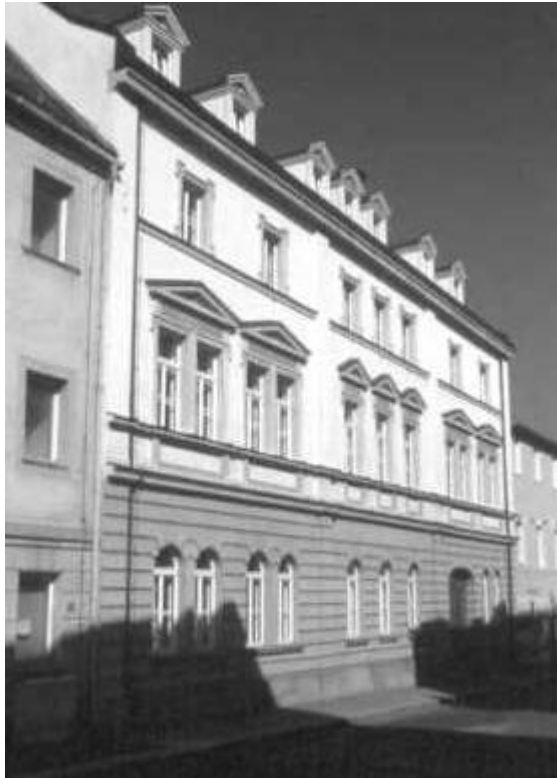
On the second floor of this building was the prayer room of the Jewish community for many years.