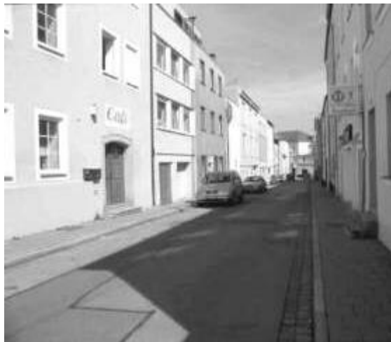
recent shot of "Judenstrasse" (Jews' lane)

1468 - 1491 Depending upon the will of the sovereign, Jews were evicted or allowed to settle down. In various records of the years 1468 to 1491 five Jewish families can be found in Cham. They had to live in a segregated quarter or ghetto. Today there is still a street by the name "Judengasse" respectively "Judenstrasse" (Jews' lane). It is said that close to the eastern end of this street the synagogue and school were situated. The last remnants of these buildings were destroyed in a fire in 1873.