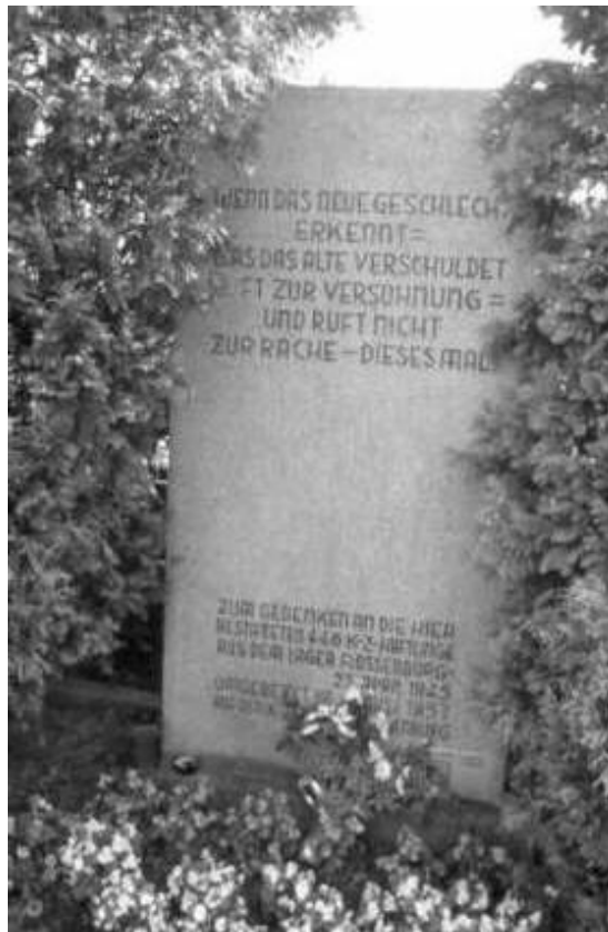
Memorial on the Christian cemetery of Cham. 446 prisoners of the concentration camp Flossenbuerg were buried here till 1957.

At first the victims of the death marches were buried on several provisional cemeteries in the county area. In Cham they were buried in a special department of the municipal cemetery which was inaugurated in 1950. After most of the bodies had been transferred to the memorial site of Flossenbuerg concentration camp in 1957, only a memorial remained here.