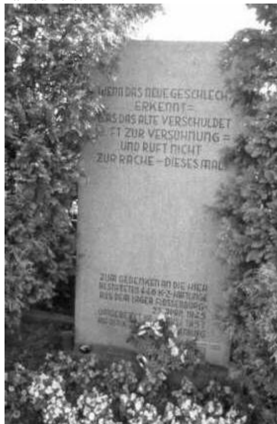
Memorial on the Christian cemetery of Cham. 446 prisoners of the concentration camp Flossenbuerg were buried here till 1957.

At first the victims of the death marches were buried on several provisional cemeteries in the county area. In Cham they were buried in a special department of the municipal cemetery which was inaugurated in 1950. After most of the bodies had been transferred to the memorial site of Flossenbuerg concentration camp in 1957, only a memorial remained here.